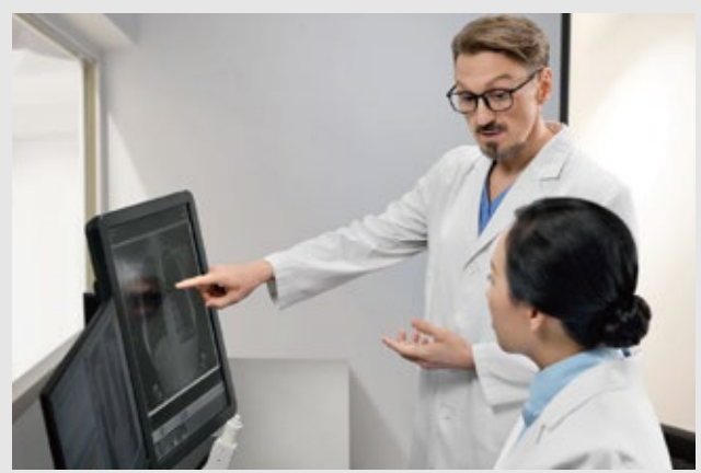
Humanized workflow for flowy operation