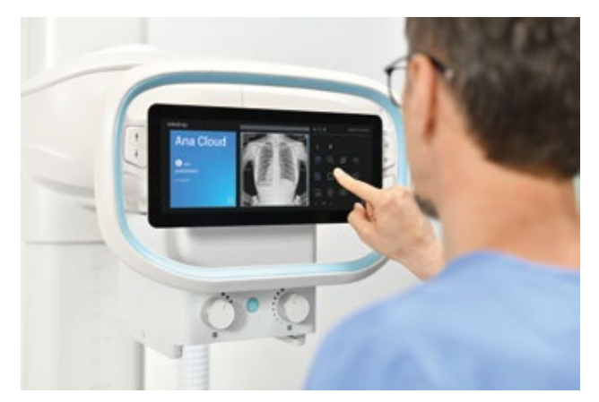
12.3 inch slim touch-screen