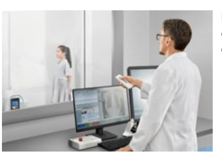
RF remote movement control, even in the console room