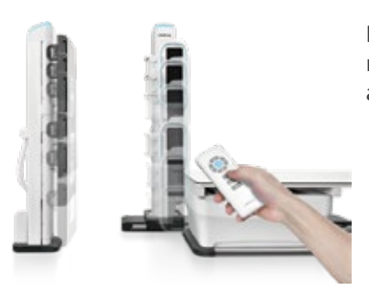
Bidirectional synchronization of the tube and bucky