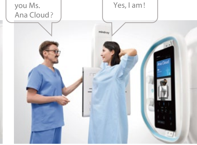
Obvious font design, confirming patient information before exposure

Pay more care to patient, and reduce visual fatigue of radiograher